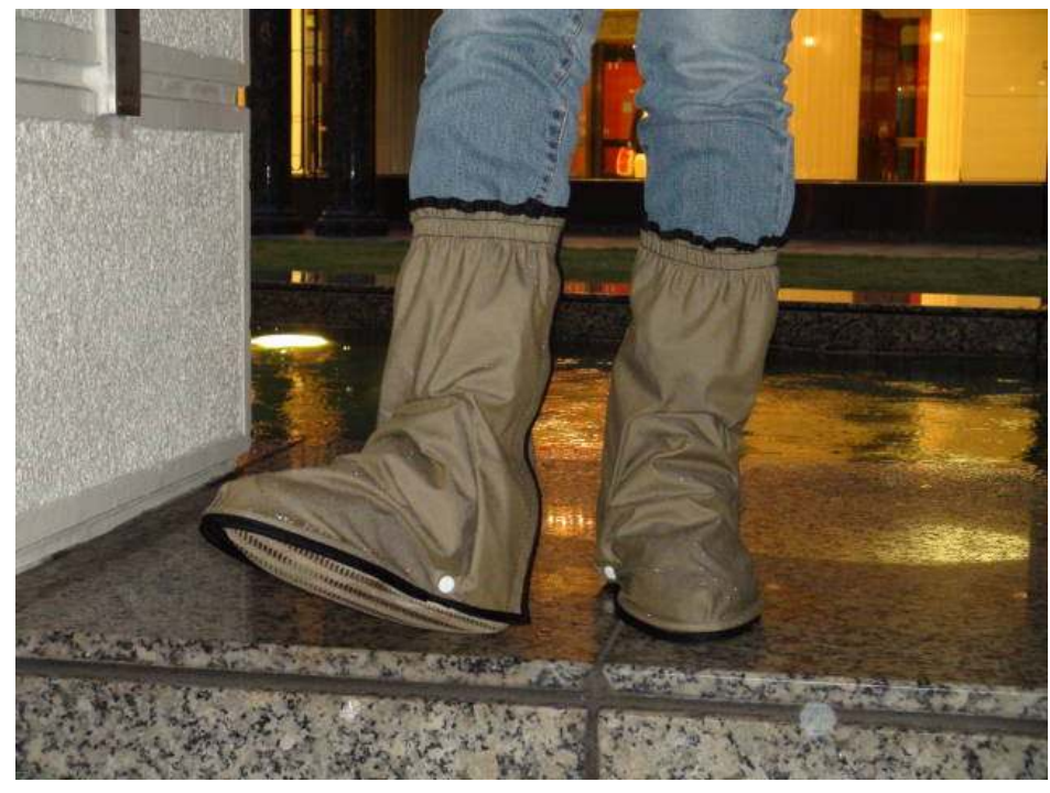
☆On high heels ☆