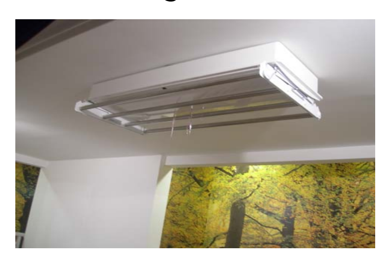
Exposure (without side bar)