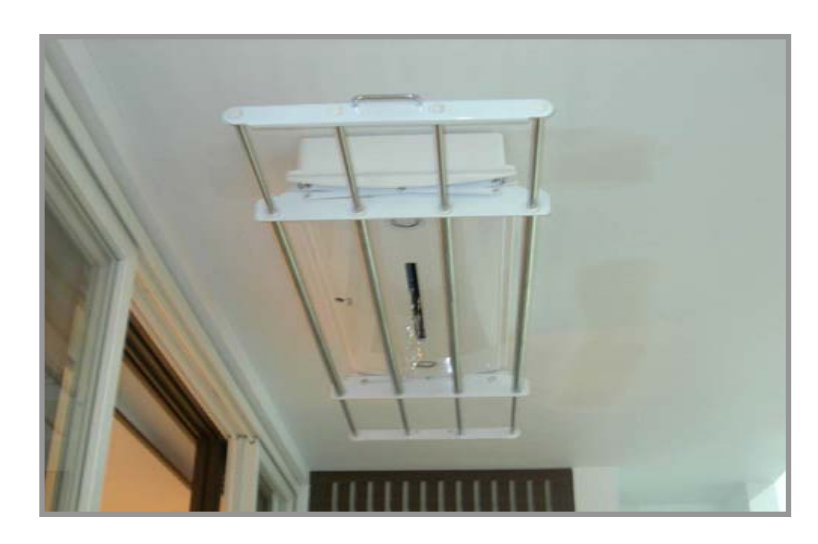
Exposure (include side bar)