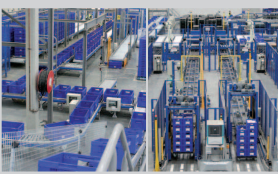
Tote conveyor system