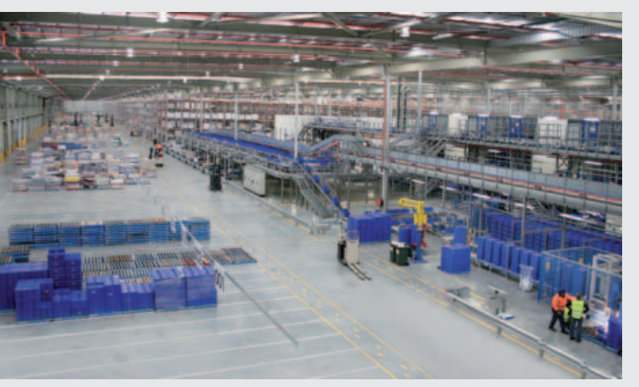
Goods receiving and empty tote buffer