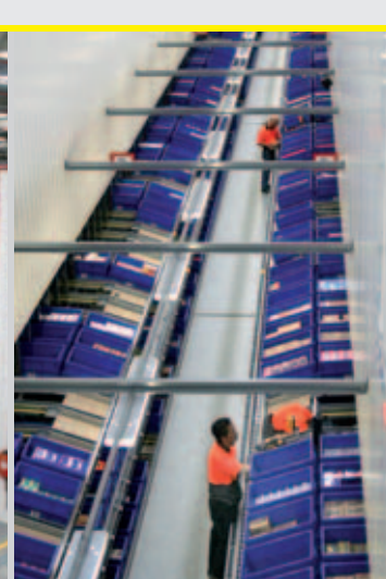
Aisle for order picking in Miniload