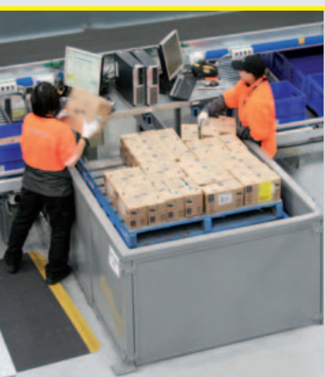
Ergonomic re-packing stations

Warehouse management, goods receiving/issuing, order picking, control of material flow, visualization, optimization of performance