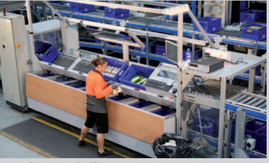
Pick-to-tote pick position of SC