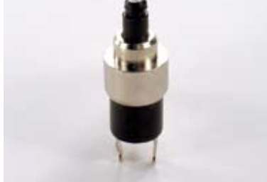
PB - 4059B

1A 125V AC Ø12.5mm B = Push ON 1 = ON-ON