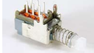
SPA -120L(N) -22G

0.1A 30V DC, 6 pin Pin Pitch: 2.5mm L= Lock N= Non Lock