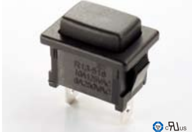
R13 - 516A

10A 125V AC, 1/8 HP Panel: 19x13mm A= Push ON