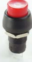
SPA-107A, B, C

3A 125V AC Ø10.2 x 11.3mm A= ON - OFF CUL, CSA B= Push ON CUL, CSA C= Push OFF