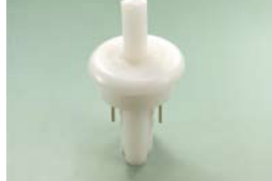
PB - 4062B, C

1A 125V AC Ø19.3mm B= Push ON C= Push OFF