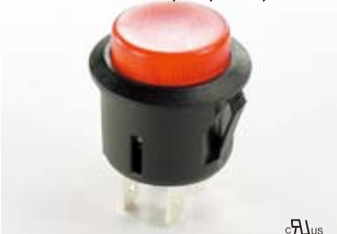
R13 - 527A, B, AL, BL

10A 125V AC Ø 20.2mm A= Push ON B= ON - OFF L= With Lamp (110, 220V)