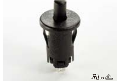
RL5-2 A, B

10A 125V AC Ø 15.0mm A= Push ON B= Push OFF