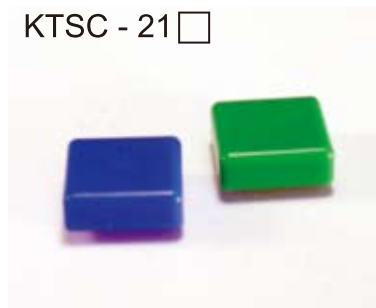
KTSC - 21

SIZE: 12x12mm, 內徑3.8mm Color: K=Black, B= Blue, G=Green, I=Ivory, R=Red, Y=Yellow For TS-2201T