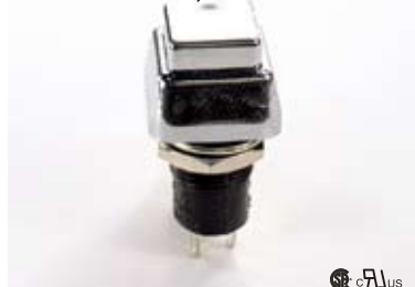
R13 - 83A, B

3A 125V AC Ø 10.2mm A= Push ON B= ON - OFF