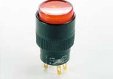
SPA - 307R-A, B

5A 125V AC Ø 16.0mm A= ON - OFF B= Push ON Button Color: Blue, Green, Red, Yellow