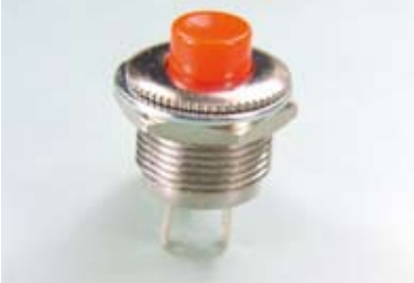
PB-4058 B, 1

1A 125V AC Ø12.5mm B = Push ON 1 = ON-ON