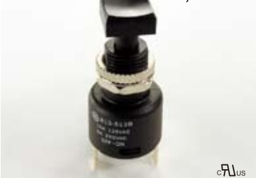
R13 - 513A1, B1, C1

10A 125V AC Ø 12.0 x 10.8mm A1= Push ON B1= ON - OFF C1= Push OFF