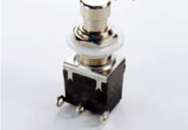
PB - 4066 -1 (M)

4A 125V AC Ø12.0mm, M: Momentary Terminal type: Solder -4066 SPDT ON - ON -4066M SPDT Push ON -4066-1 DPDT ON - ON -4066-1M DPDT Push ON