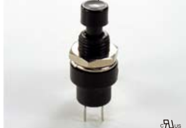
R13 - 509A, B

3A 125V AC Ø 7.0mm A= Push ON B= Push OFF