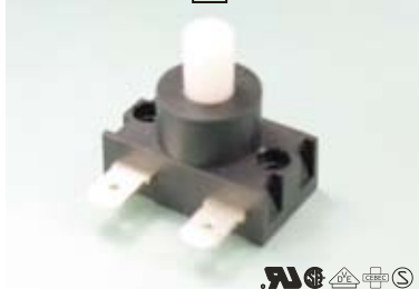
P8 - 10S - □ - X

10A 125V AC OF: Max. 860g □ = 0 = Non Lock □ = 1 = Lock X = A = Solder terminal X = B = Quick connect terminal