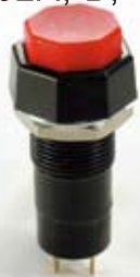
SPA-102A, B, C

3A 125V AC Ø12.5mm A= ON - OFF B= Push ON C=Push OFF