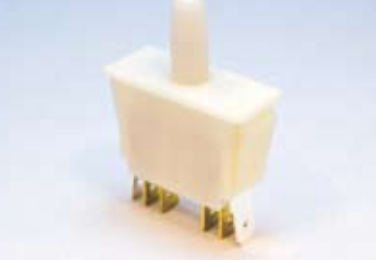
PB - 4065

3A 125V AC Mounting Hole: 40.2x17.4mm ON-ON