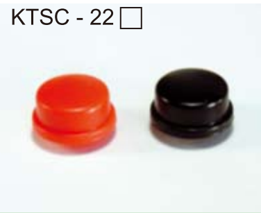
KTSC - 22

SIZE: Ø 13mm, 內徑3.8mm Color: K=Black, B= Blue, G=Green, I=Ivory, R=Red, Y=Yellow For TS-2201T