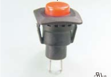
R13 - 510A, B

3A 125V AC Ø 12.7mm A= Push ON B= Push OFF