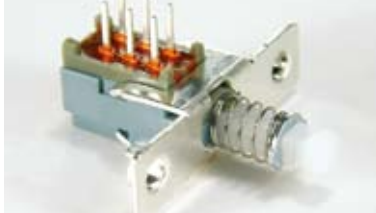
SPA -120L(N) -22B

0.1A 30V DC, 6 pin Pin Pitch: 2.5mm Pitch Hole: 20mm L= Lock N= Non Lock