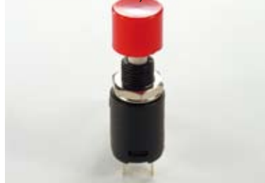
R13 - 512A, B

3A 125V AC Ø 7.0mm Button: Ø 6x5mm, Ø 10x8.5mm A= Push ON B= ON - OFF