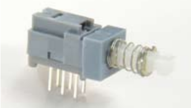
SPA -120L(N) -22

0.1A 30V DC, 6 pin Pin Pitch: 2.5mm L= Lock N= Non Lock