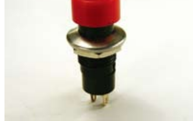
PB - 4051A, B, C

3A 125V AC Ø12.5mm A= ON - OFF B= Push ON C= Push OFF