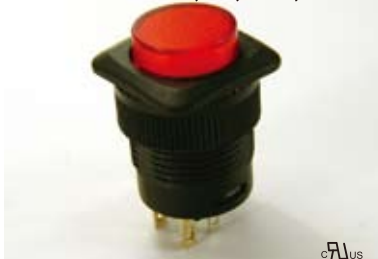
R13 - 508A, B, AL, BL

3A 125V AC Ø 16.0mm A= Push ON B= ON - OFF L= With LED (3V DC)