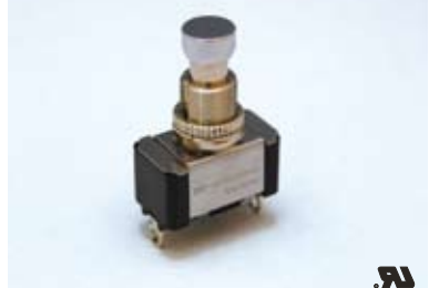
R13-41 A, C

10A 125V AC Ø 12.2mm A = push-on C = on-on