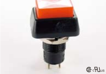
R13 - 92A, B

3A 125V AC Ø 10.2mm A= Push ON B= ON - OFF