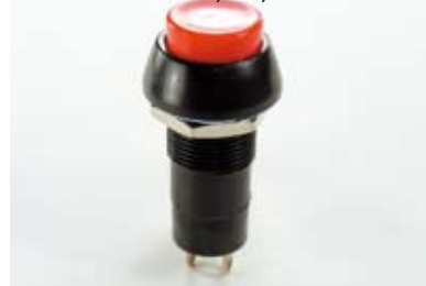
SPA - 101A, B, C

3A 125V AC Ø12.5mm A= ON - OFF B= Push ON C= Push OFF