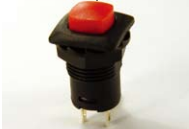
R13 - 511A, B

3A 125V AC Ø 12.7 x 11.4mm A= Push ON B= ON - OFF