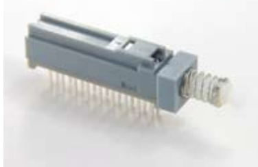
SPA - 120L(N) - 62

0.1A 30V DC, 18pin Pin Pitch: 2.5mm L= Lock N= Non Lock