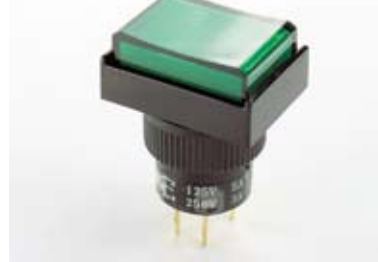
SPA - 307S-A, B

5A 125V AC Ø 16.0mm A= ON - OFF B= Push ON Button Color: Blue, Green, Red, Yellow