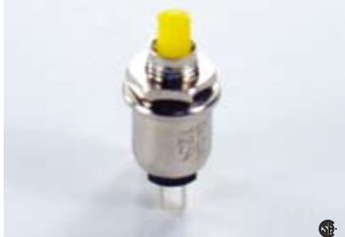
R13 - 81A

10A 125V AC Ø 20.2mm A= Push ON B= ON - OFF L= With Lamp (110, 220V)