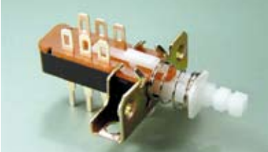
SPA -119 Series

0.5A 50V DC Screw Hole: 20mm Pin Pitch: 4.0mm