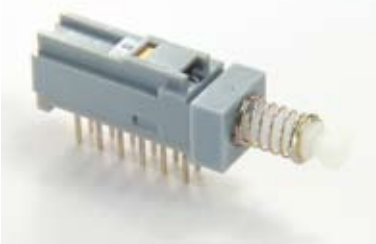
SPA - 120L(N) - 42

0.1A 30V DC, 12pin Pin Pitch: 2.5mm L= Lock N= Non Lock