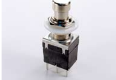
PB - 4066P -1(M)

4A 125V AC Ø12.0mm, M: Momentary Terminal type: PCB -4066P SPDT ON - ON -4066PM SPDT Push ON -4066-1P DPDT ON - ON -4066-1PM DPDT Push ON