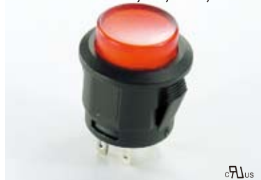
R13 - 523A, B, AL, BL

3A 125V AC Ø 16.0mm A= Push ON B= ON - OFF L= With LED (3V DC)