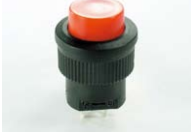
SPA - 502 - 1

3A 250V AC Ø 16.0mm A= ON - OFF B= Push ON