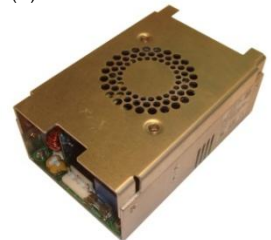
F Type (U-Chassis with top built-in fan) : 3.2(W) x 5(L) x 2(H) inches.