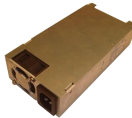
E Type (Enclosed with end built-in fan): 3.2(W) x 6.5(L) x 1.6(H) inches