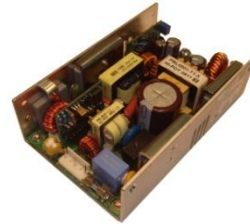
U Type (U-Chassis only): 3.2(W) x 5(L) x 1.5(H) inches.