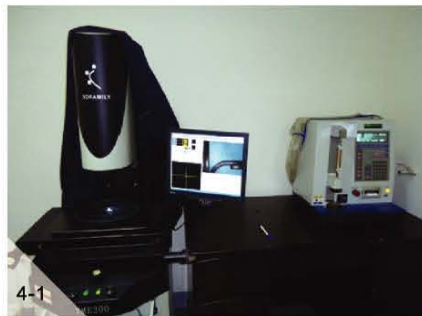
4-1 品檢設備 Comparator and Spring Load Tester

4-2 輸送帶熱處理 及冷卻設備 Auto Conveyor Oven and Cooling Fan