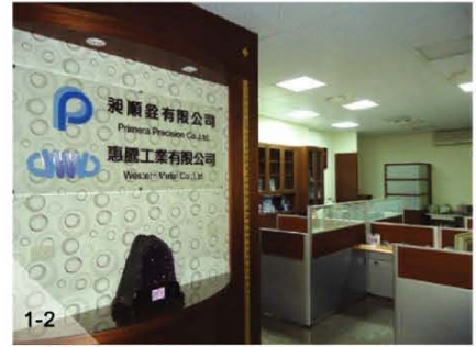
1-2 辦公室 Office