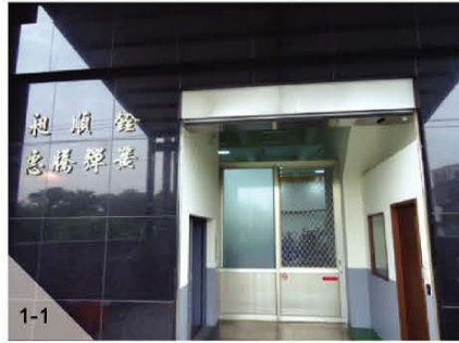
1-1 彈簧廠正門 Spring Factory