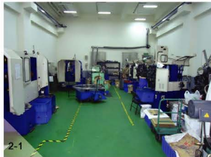
2-1 彈簧廠 CNC Spring Formers