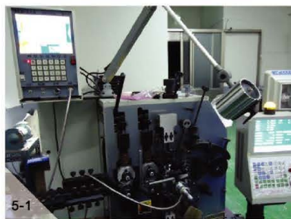
5-1 壓簧機及自動檢長設備 Spring Coiler & Length Detector

5-1 壓簧機及自動 檢長設備 Spring Coiler & Length Detector