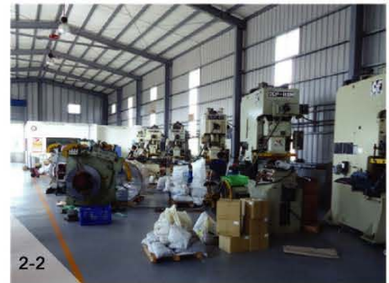
2-2 沖壓廠 Stamping Factory