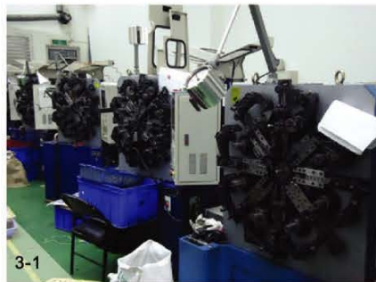
3-1 彈簧廠 CNC Spring Formers