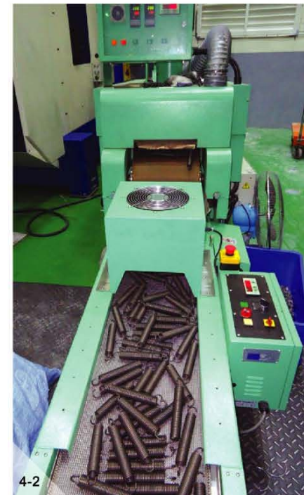
4-2 輸送帶熱處理及冷卻設備 Auto Conveyor Oven and Cooling Fan

4-2 輸送帶熱處理 及冷卻設備 Auto Conveyor Oven and Cooling Fan