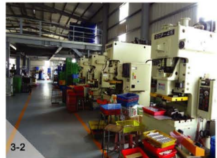
3-2 沖壓廠 Stamping Factory