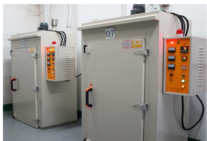
Constant Temperature Oven