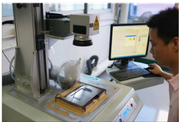
Laser Engraving Machine