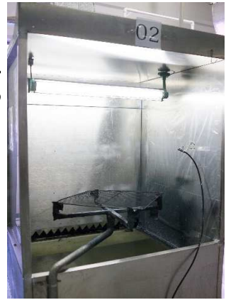
Hand Spraying Equitment