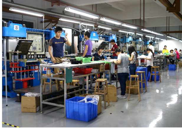
Molding Machine and Workshop