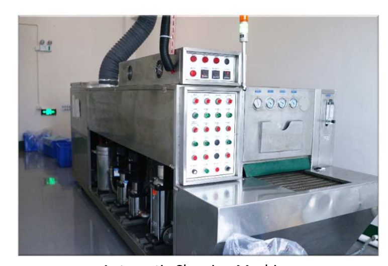
Automatic Cleaning Machine