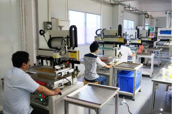
Screen Printing Machine