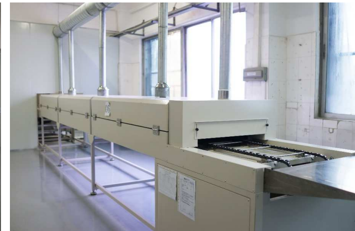
IR Conveyor Oven