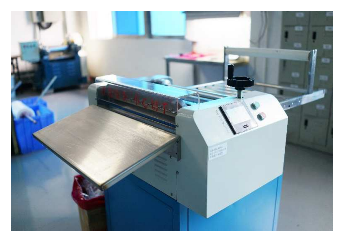
Material Cutting Machine