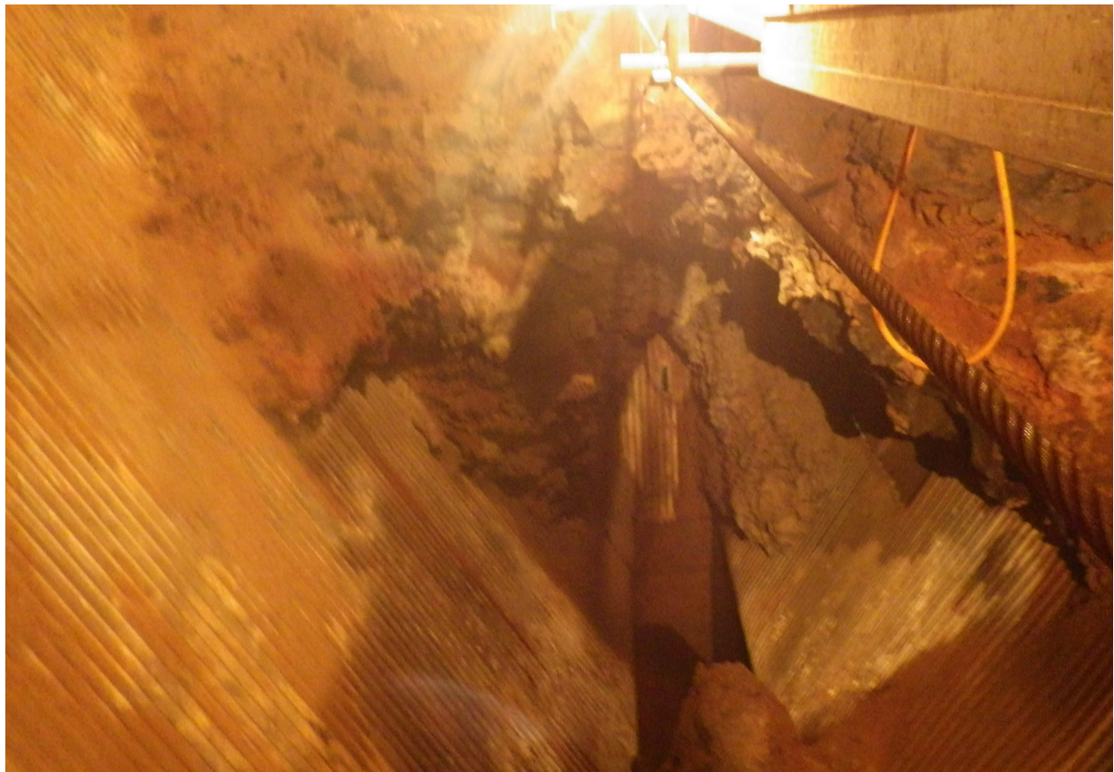
爐渣清除 Clinkers & Slags