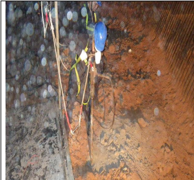
使用 ATD 氣動鑽岩機挖掘孔洞 Use ATD Drill Equipment to drill hole